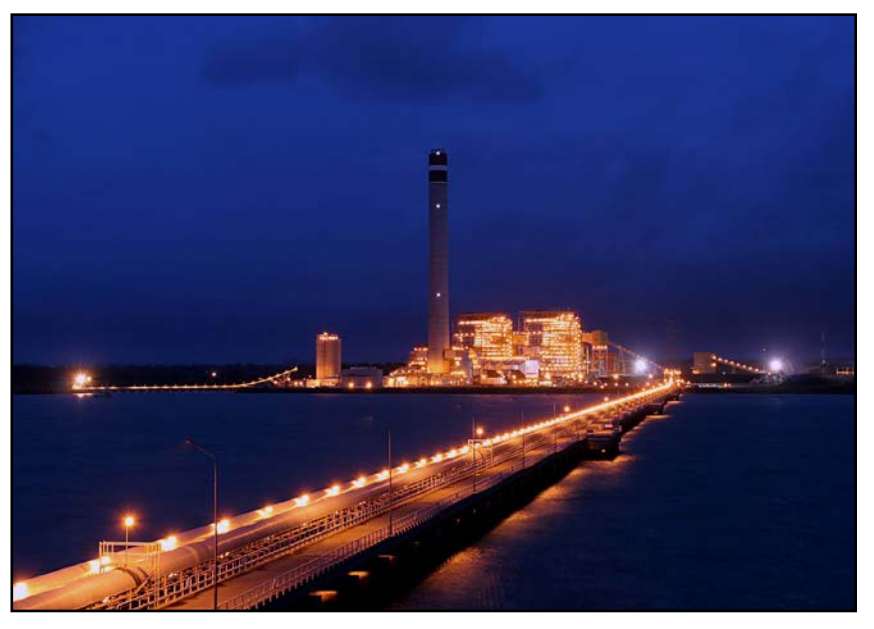
Tanjung Jati B Units 1 and 2 in operation.