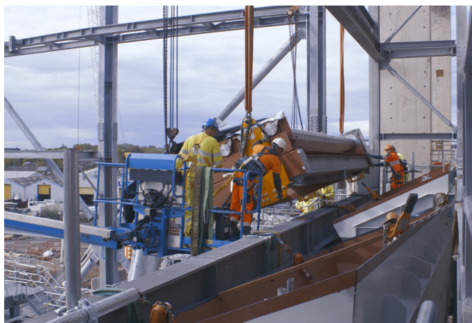
One of the ten modular DynaGrate sections being lifted into place.

Owned by Enfinium, a provider of WTE facilities throughout the U.K., the Kelvin plant will utilize state-of-the-art steam generation and combustion technologies from Babcock & Wilcox Renewable (B&W). Working with Acciona as the engineer-procure-construct (EPC) contractor, the plant features the largest WTE boiler ever supplied by B&W (at the time of installation).